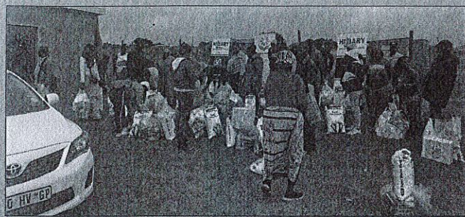
Faranani Paralegal and Advice, in partnership with Hillary Construction, handed over food parcels to 80 needy households facing food insecurity. The donation was held at Luvhaha village on 19 March. The food parcels included items such as maize meal, rice and sugar.